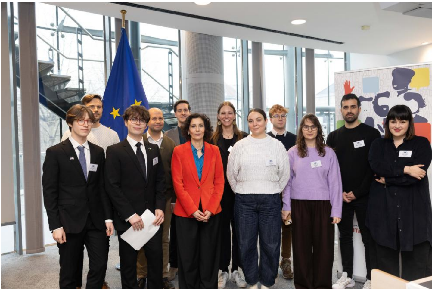
Organisers meet with the Commissioner Hadja Lahbib, Commissioner for Preparedness, Crisis Management and Equality.

Following the formal submission of the initiative, the organisers met with Commissioner Hadja Lahbib , Commissioner for Preparedness, Crisis Management and Equality, on 12 December 2025 .