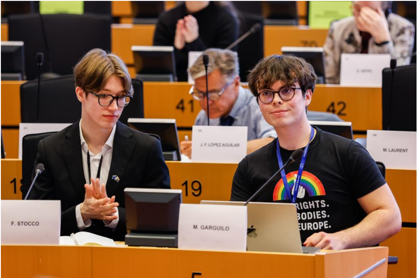
Organisers at the public hearing at the European Parliament.

The initiative was presented at a public hearing in the European Parliament on 2 March 2026 . The hearing was organised by the LIBE Committee with the involvement of the Committee on Petitions (PETI) and the participation of the Committee on Gender Equality and Women's Rights (FEMM) . During the Parliament hearing, the organisers mentioned that they are well aware of the difficulties involved in proposing legislation and referred to the issuance of a Commission Recommendation as a measure that might produce effects rapidly.