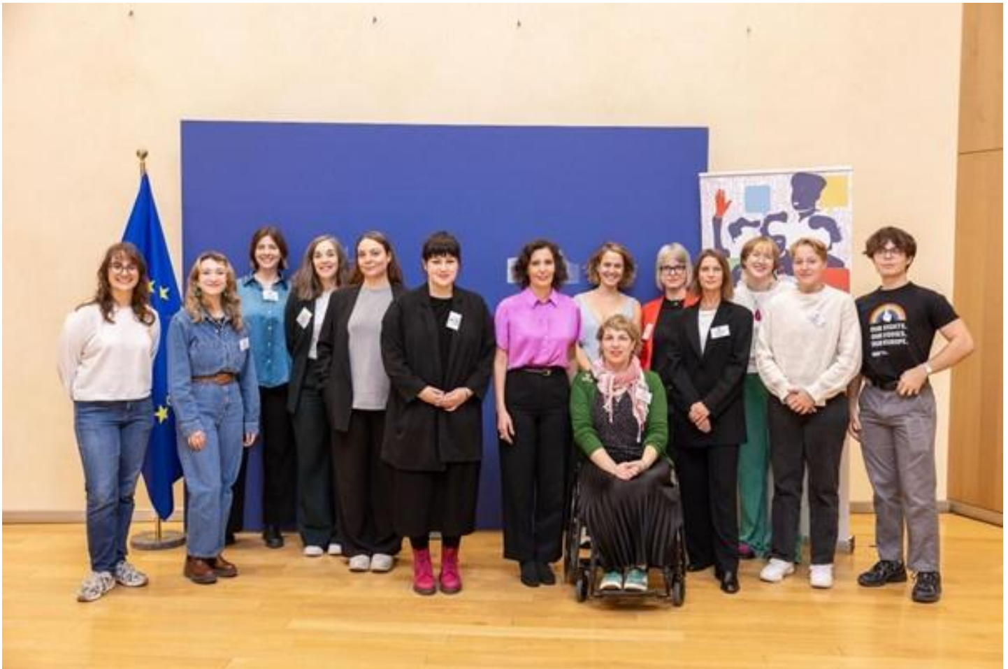
Visit of the organisers of the “My Voice, My Choice” European Citizens' Initiative to the European Commission, Brussels, 1 October 2025