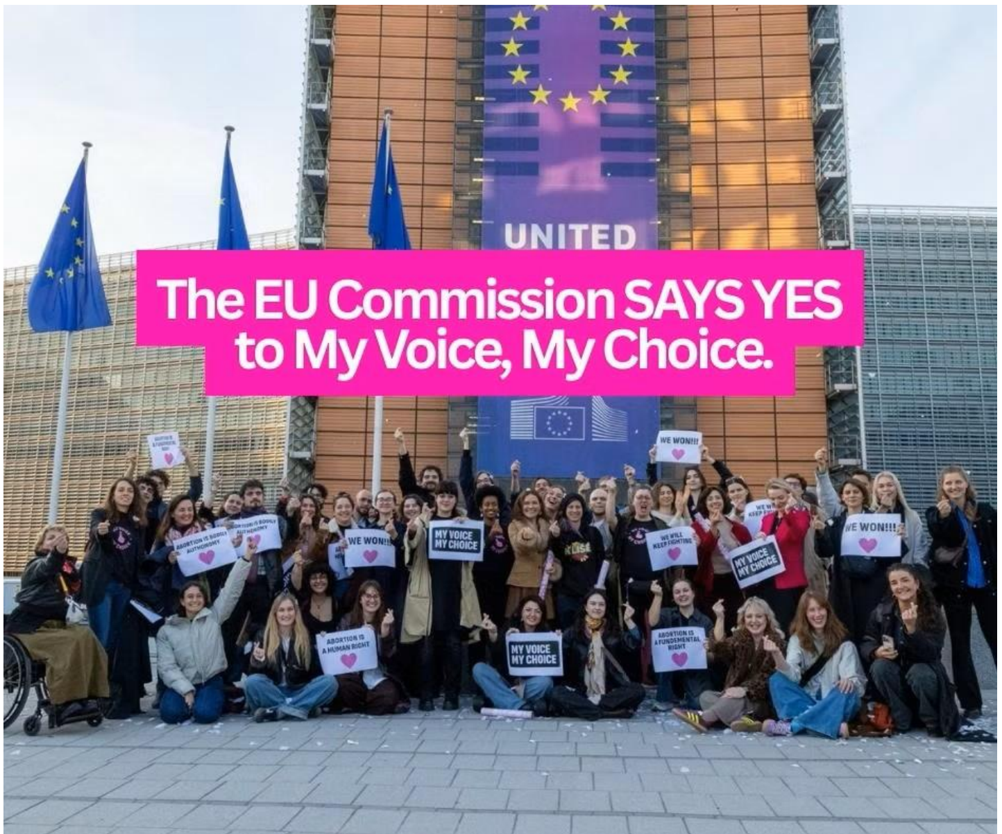
The activists of "My Voice My,Choice" celebrating in front of the European Commission in Brussels.

The Commission underlined that this support can be provided relatively quickly through existing instruments, without the need for new legislation, provided Member States voluntarily choose to allocate or reallocate available resources under their ESF+ programmes.