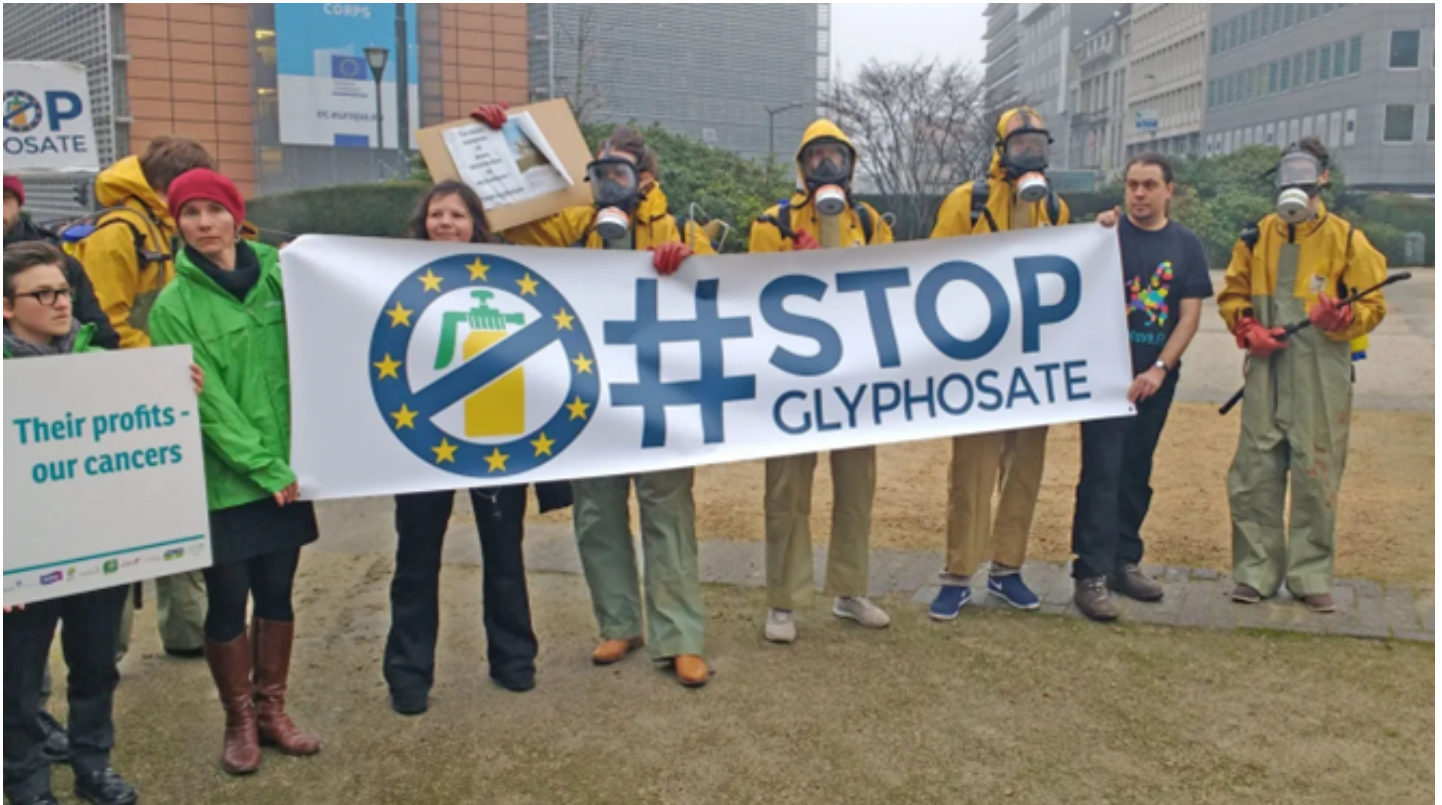
Glyphosate: organisations launch a European citizens' initiative to ban glyphosate